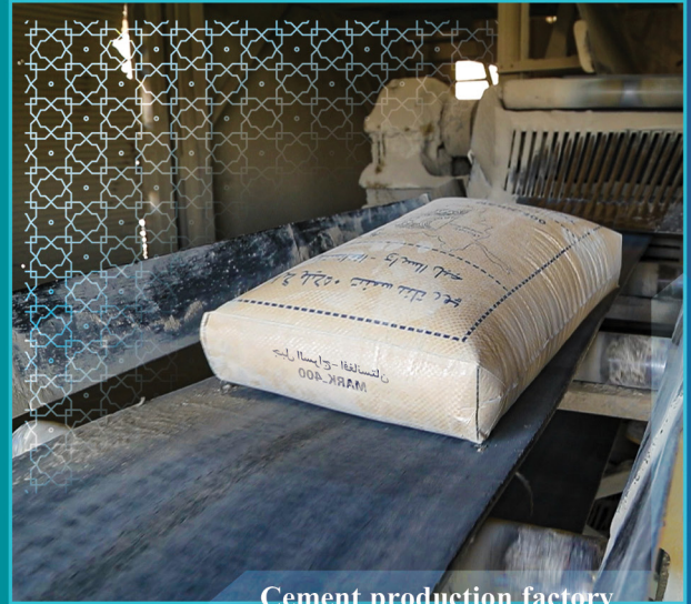
Cement production factory

National Development Corporation has remarkable achievements in the area of production . Increasing production rate of Ghori cement factory from 400 tons to 500 tons per day, daily production of 20 to 80 tons of cement in Jabal Al Saraj cement factory, production of parts and pre-construction elements for the construction and completion of construction projects, production of oxygen, concrete block, and superfine marble are the activities of the corporation in the manufacturing sector .