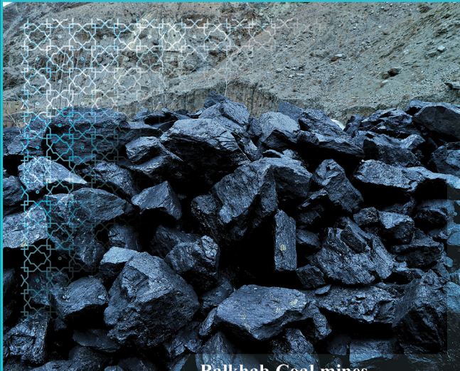
Balkhab Coal mines