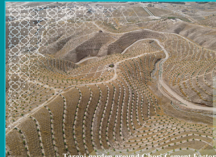
Taraqi garden around Ghorri Cement Factories