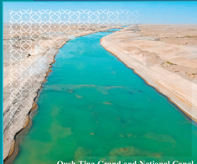
Qush Tipa Grand and National Canal

The water management of the country is one of the priorities of the National Development Corporation and there are dozens of the projects the implantation of which are underway . Digging the huge and national Qushtipa canal in the North of the country, construction of Turko and Qala Afzal canals of Kamal Khan Dam in Nimroz Province, Aabi Canal in Farah Province, Machalgho Dam in Paktia Province, Tori Dam in Zabul Province and planning and design of 42 dams are on the top of the list of NDC programs for various parts of the country .