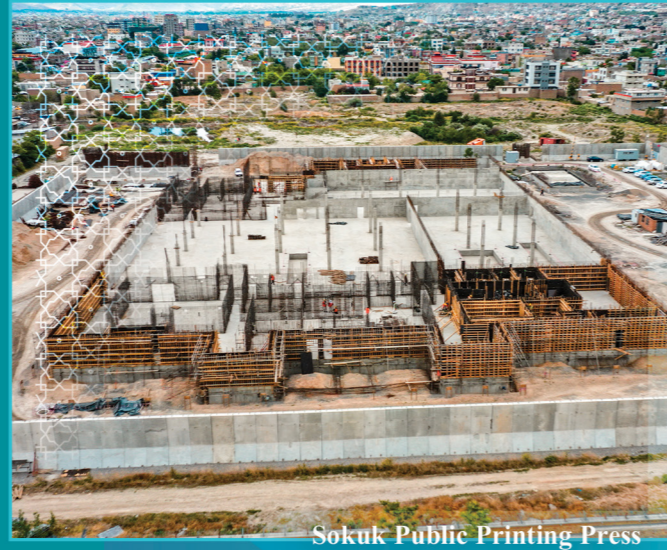
Sokuk Public Printing Press

The National Development Corporation has been working on a large number of construction and infrastructure projects at large, medium and small levels in all the provinces of country since the beginning of its activities, including the construction projects of 423 mosques in different provinces of country, 102 Waiting rooms for hospitals, construction of Hospitals for Covid-19, Darul Aman administrative Complex, Sukuk Printing Press, Surface Water Management Project of Kabul City, Bagrami Township, Sanai Ghaznavi Township, Lala Residential Complex and Afghan National Palace (Qasr Mili Afghan).