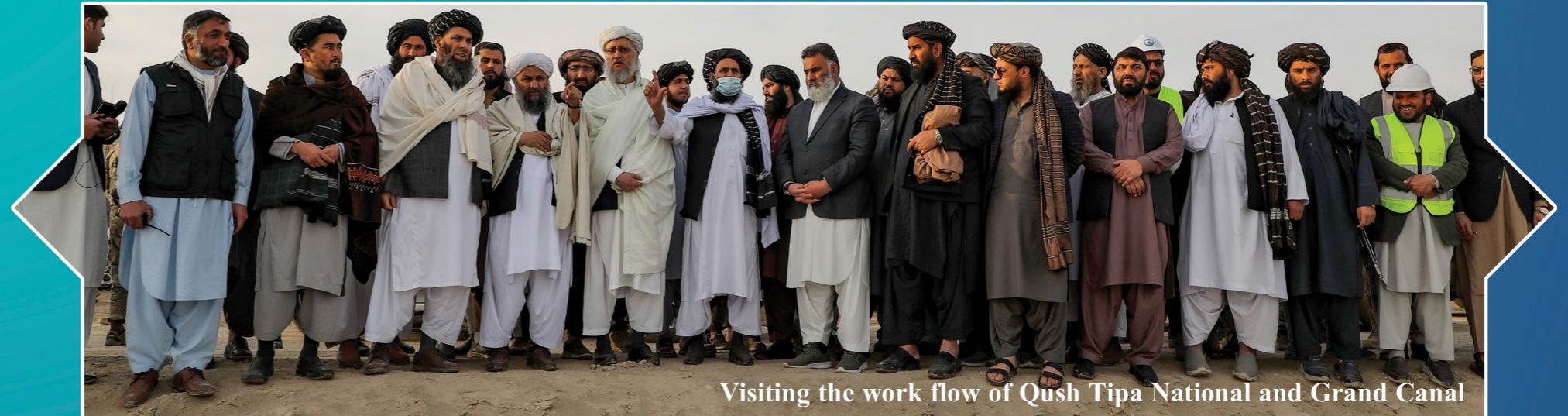
Visiting the work flow of Qush Tipa National and Grand Canal